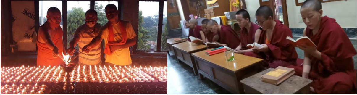
Photo: Puja in our temples, and lights were offered at the main temple Bodhgaya for all these students.

transform it into a wonderful Light of love and peace. We, with our Masters, the Lamas, the pundits, the Christian guides of our interfaith school, remind you of what you learned at school: "Any vision appears these days, in these weeks of transition, fear not! Everything is a creation of your consciousness. Recognize in those images, beautiful or fearful, the manifestation of your divinity that will manifest himself for you with the face of Shiva!"