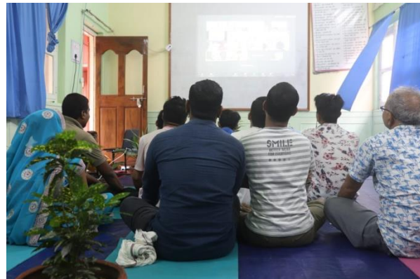
Group of students and teachers during the online meeting