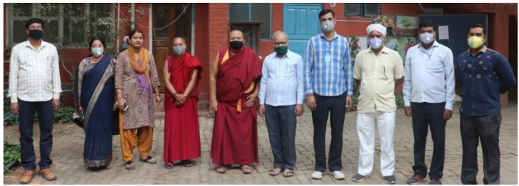
(The team now)

New FDs for the school students and teachers: Recently in the month of December the administration and management decided to renew the FDs of last year and make a new FD of 50 Lakh which can be fixed life time period for the teachers and students welfare.