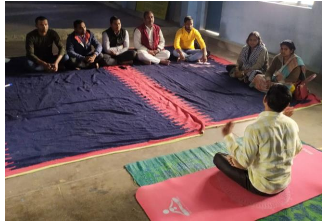
Teachers during the Yoga lessons and practical demonstration of how to teach math

The teachers training also had a practical part of Karma Yoga, where everyone joined in cleaning, watering, and maintaining the school compound, the campus, classroom and the garden.