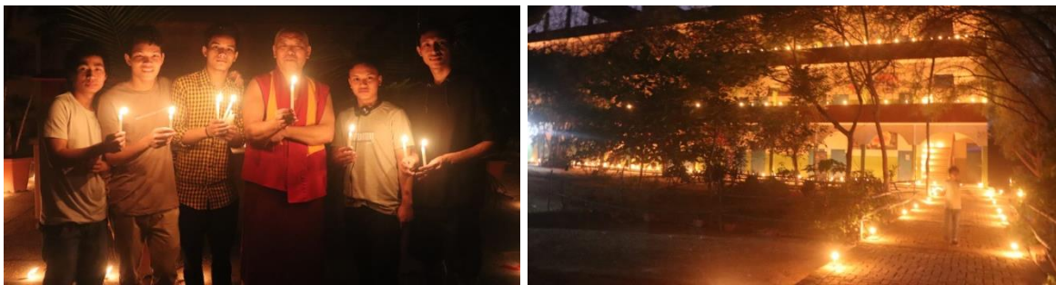
The Diwali celebration

Diwali celebration and feast for all the teachers, residential students and the staff: We were extremely fortunate that the whole Alice Project family could celebrate Diwali in the presence of this holy master, who not only joined the celebration but also offered a feast to all the teachers, staff and the residential staff.