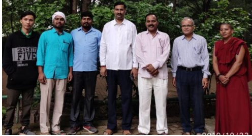
(The team last year)

management and accounts were added in the management team with other members to support and run the projects smoothly. We wish all the best to them.