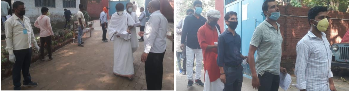
Sanskrit students at the gate for the thermal scanning and Sanitization

Total 345 students of B. Ed, M.Ed and PHD appeared in the exams in both the sessions of the day. A group of 52 teachers, office staff and other workers did a great effort to make this possible. As Alice Project - Sarvabhaumik , Sikshsram Sanskrit Mahavidyalaya was the only examination center in whole Uttar Pradesh (the state). It was a great achievement for us.