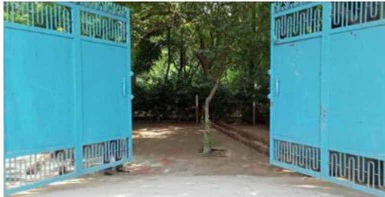
A view of the new gate that enters the school

This year in summer we solved a major problem that we have been facing since many years. It was challenge for us to have a proper road in all these years. But this year we solved this major issue also. And we could purchase a new piece of land and a road directly to our compound was made at once.