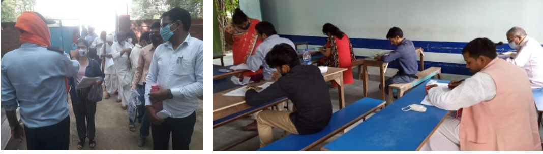
Sanskrit students at the gate and during the exams.

Schools have been thrice awarded by the University for its Work in the field of Education and its research.