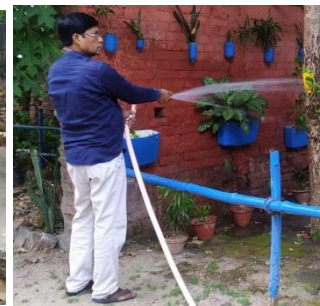
Teachers during the Karma Yoga

It was very nice to see the teachers attending these training with keen interest and enthusiasm. They said that it was very nice to have this chance to make a revision and learn new concepts.