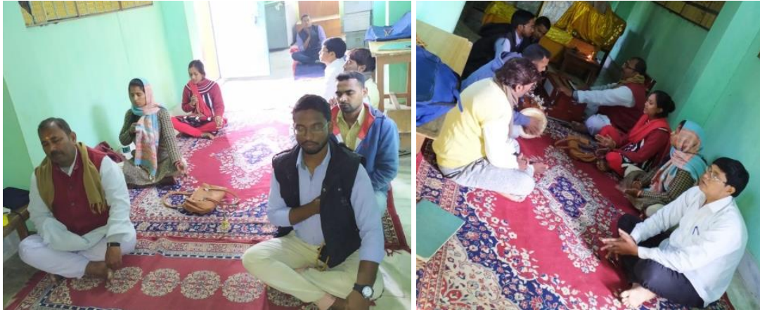
Teachers while chanting the Gayatri Mantra and Singing Bhajans