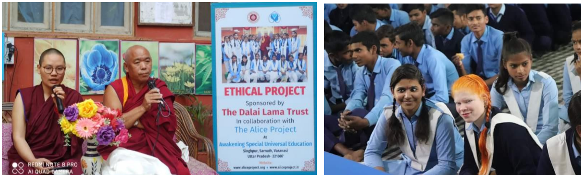
File photo : Lama addressing to the students of Alice Project during his last visit

Diwali celebration and feast for all the teachers, residential students and the staff: We were extremely fortunate that the whole Alice Project family could celebrate Diwali in the presence of this holy master, who not only joined the celebration but also offered a feast to all the teachers, staff and the residential staff.