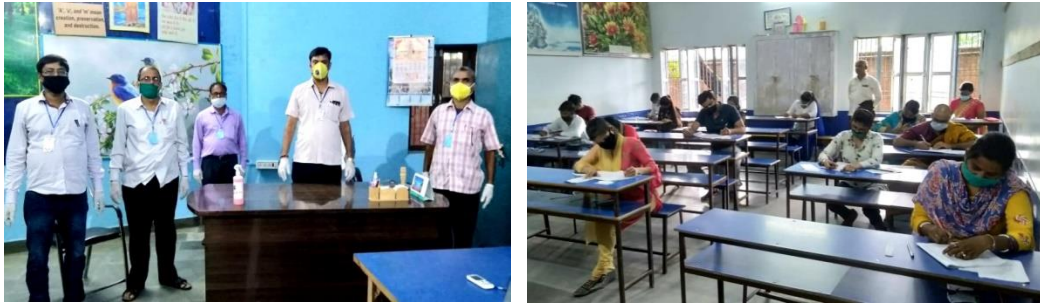
The team of Management and the studnets during the exams

Total 345 students of B. Ed, M.Ed and PHD appeared in the exams in both the sessions of the day. A group of 52 teachers, office staff and other workers did a great effort to make this possible. As Alice Project - Sarvabhaumik , Sikshsram Sanskrit Mahavidyalaya was the only examination center in whole Uttar Pradesh (the state). It was a great achievement for us.