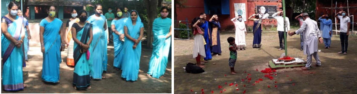
Teachers of Sarnath and Bodhgaya Schools

Therefore one should always understand this truth and keep in the mind that we have to be free... and keep thinking and making effort to get the ultimate freedom.