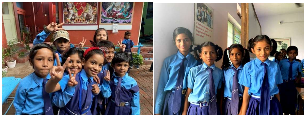
Students of Sarnath and Bodhgaya