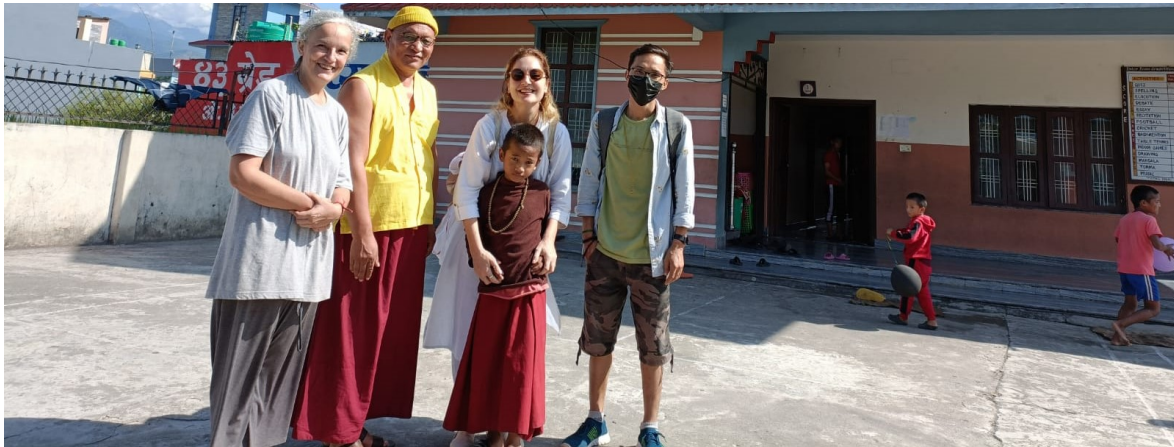
We at the monastery of Lama