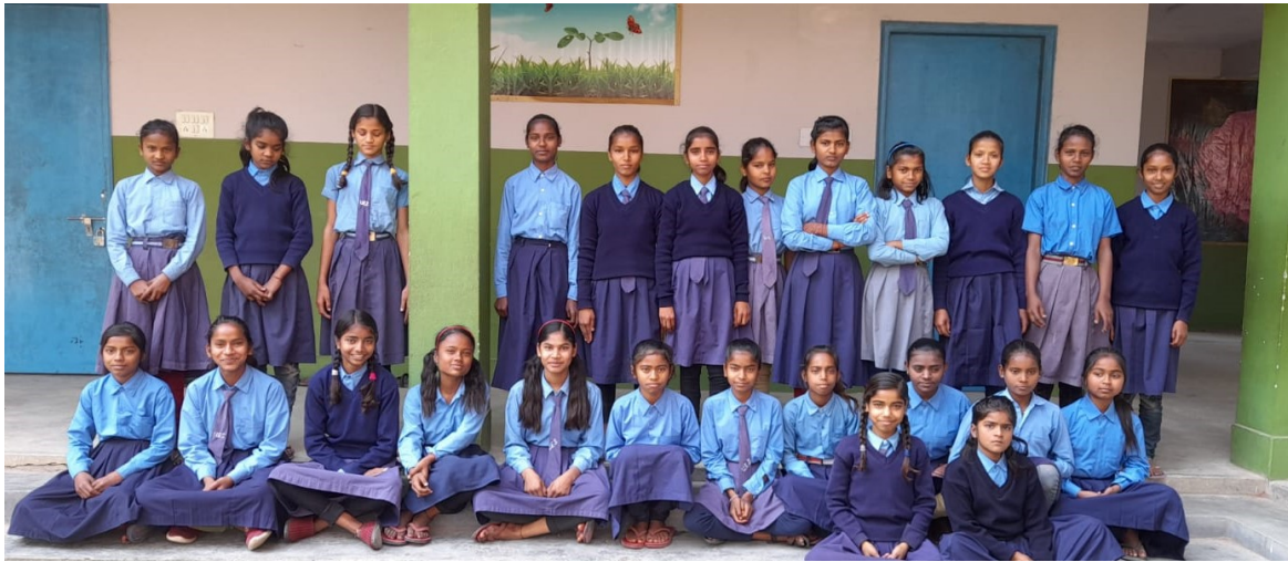
Girls of the literacy project

As these female children like the chakma students, who are coming to our hostel, they too, belong to needy families that are not in a situation to afford extra classes and coaching. Therefore the administration decided to help these children and we can see there is a progress in these students. We thank all our supporters who are helping us to make this project a successful one.