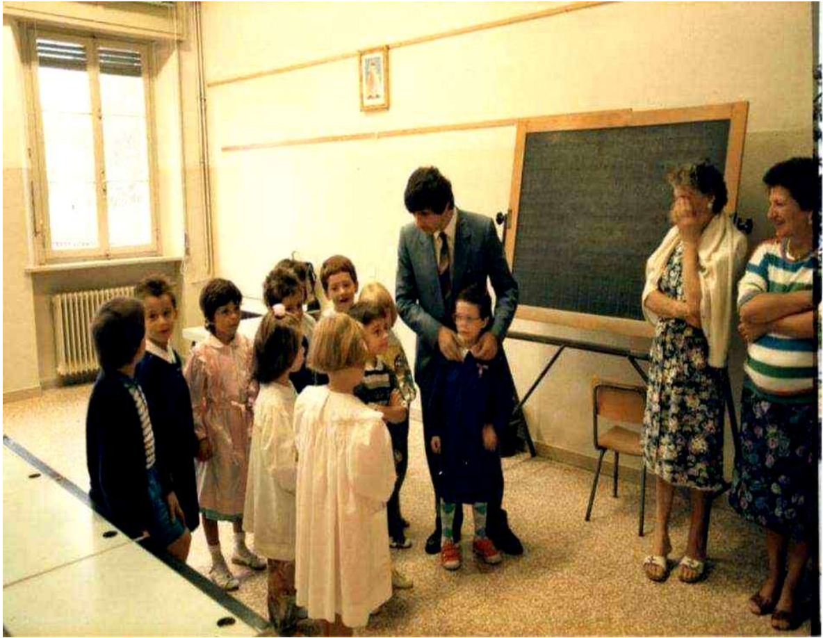
The founder in his experimental class, in Governmental School, in Italy, in 1987.

We started from the observation of the failure of the education system in the world which is inspired by a single idea: industrialization.