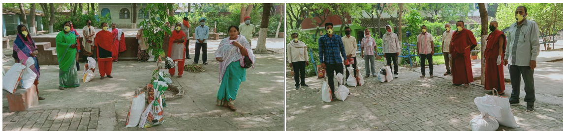
Group of teachers with the food supplies.