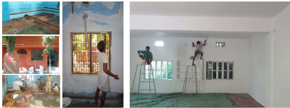
The workers doing the painting and other maintainance work.

Where it was extremely needed the walls were white washed and other parts of the building were repaired and painted.