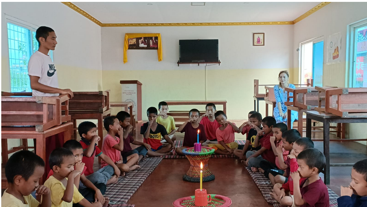
In fact a couple of online/offline lessons were done with the monks of the monastery.