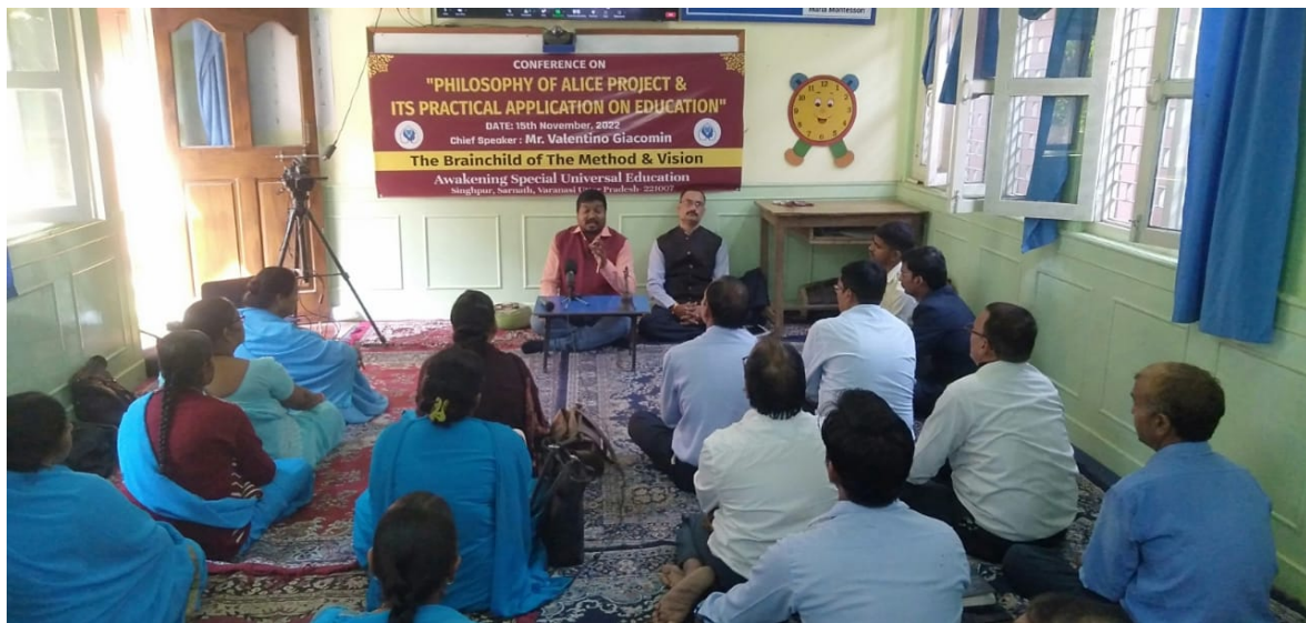
The participants expressing their views during the conference

On 15 th of November a conference on the topic: "The Philosophy of Alice project and its practical application on education was organized at the Alice Project Sarnath Branch. "