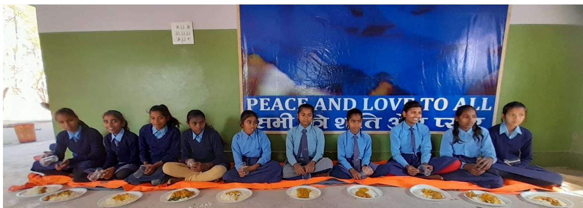
Girls of the literacy project , during the lunch break.

To provide a chance for better education, specially to the female students of our schools, we are always ready. In this series, we have launched literacy program for the female students of our school. Soon the new chakma resident girls will join other girl – students of our school.