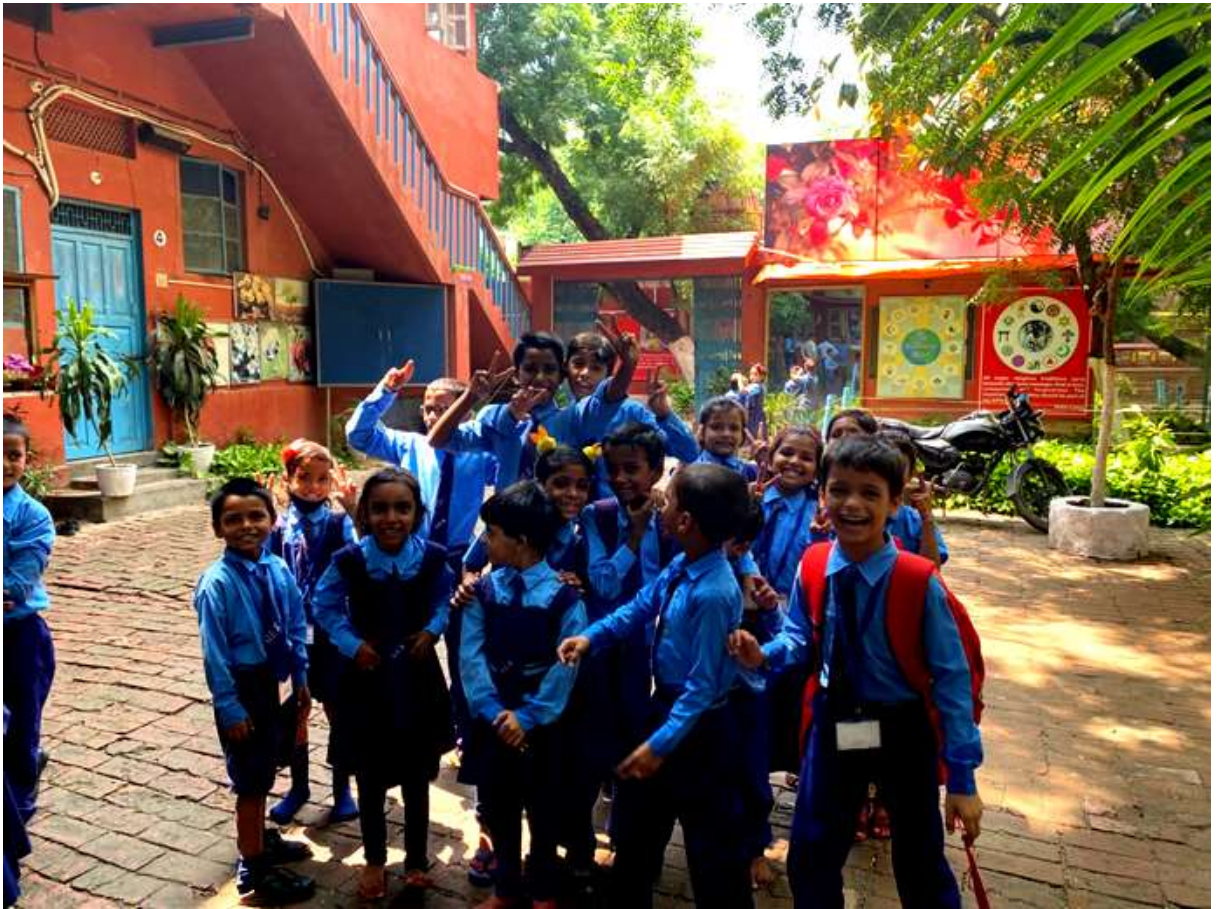
The research continues since 29 years in India, at the suggestion of His Holiness the Dalai Lama.